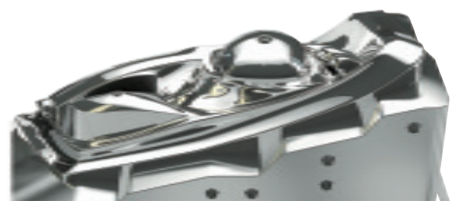
A highly polished mould for production of car headlights.

The properties are representative of samples taken from the centre of bars with dimension 596 x 296 mm unless otherwise is indicated. Values of different mechanical properties depend on dimension of original material, position and direction of samples as well as hardness and test temperature.