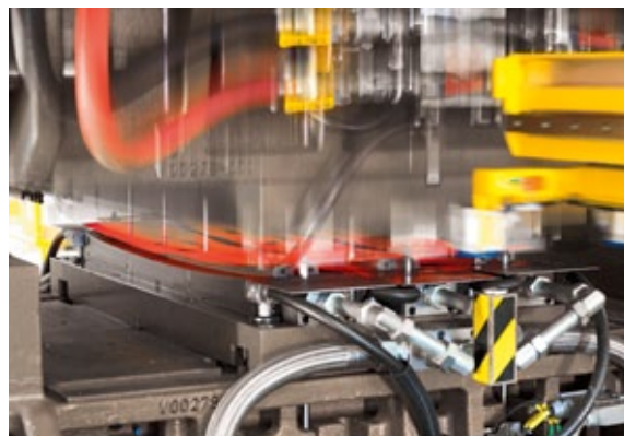
Plasma or gas nitriding can be used on hot stamping tools to further increase hot wear resistance and reduce friction between the tool and sheet materials.