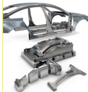
Coatings of PVD type, carried out after nitriding, improve the resistance to abrasive wear and galling.