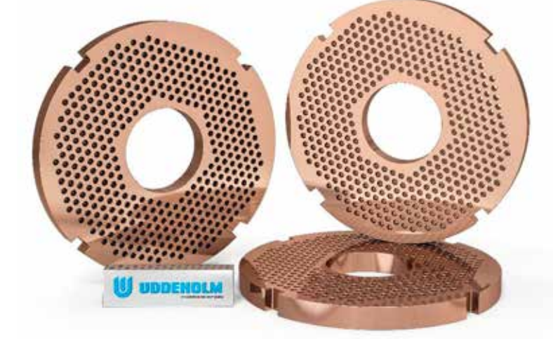
Hole-plates manufactured using Uddeholm Vanax SuperClean