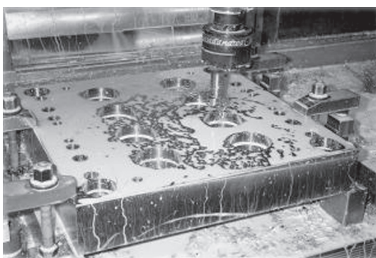
Machinability is a critical property during manufactring of holder plates.