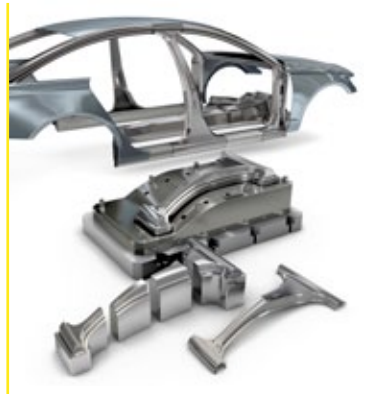
Coatings of PVD type, carried out after nitriding, improve the resistance to abrasive wear and galling.