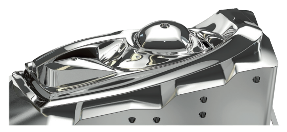
A highly polished mould for production of car headlights.

The properties are representative of samples taken from the centre of bars with dimension 596 x 296 mm unless otherwise is indicated. Values of different mechanical properties depend on dimension of original material, position and direction of samples as well as hardness and test temperature.